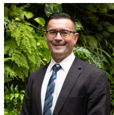
Courtney Street 02 49 26 3933

1.5km to Wallsend shopping centre 6.3km to John Hunter Hospital 12.4km to Newcastle CBD